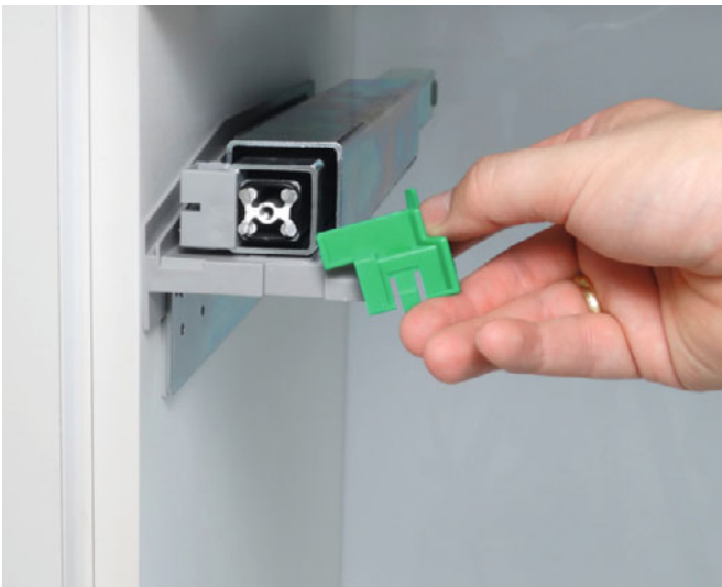
Remove transportation lock.