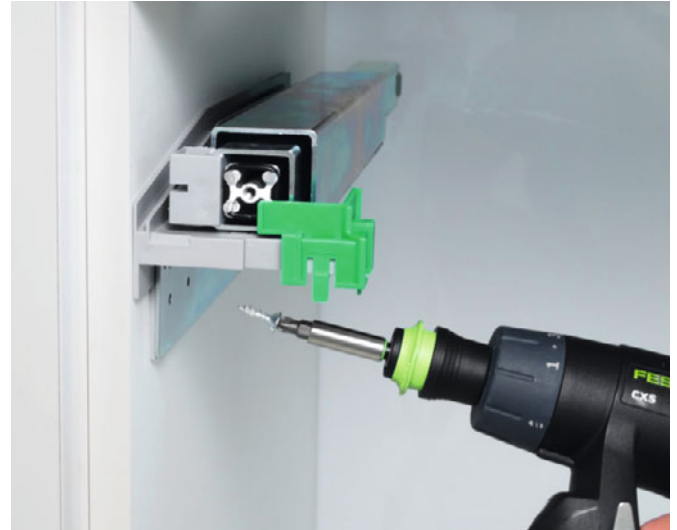
... for easy fixing.