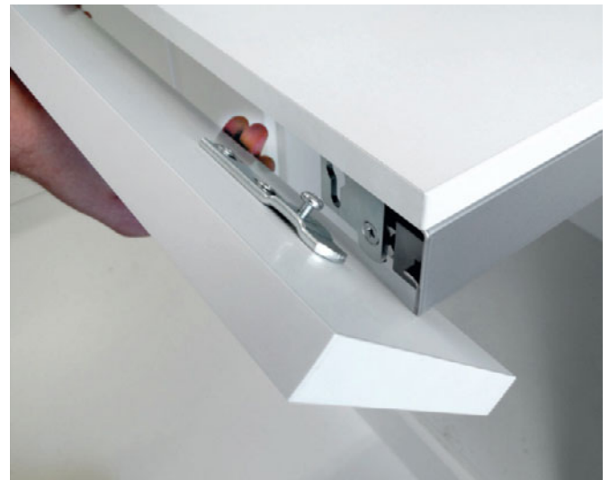
Click front into place and fix it.